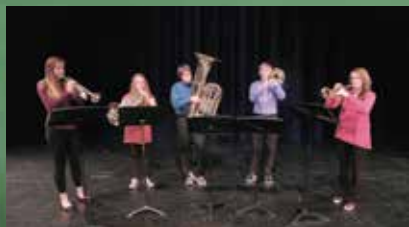
SOUTH MEDFORD BRASS QUINTET South Medford High