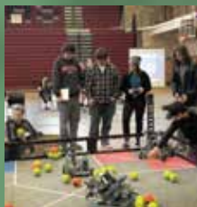
ROBOTICS South Medford High